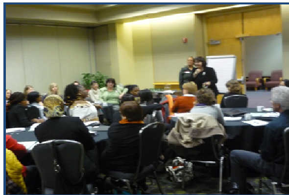
Health & Wellbeing Sub-council Discussion

Immigrant health and well-being is supported through a range of programming including mental health, impact of trauma/war, access to services, recreation, nutrition and life skills.