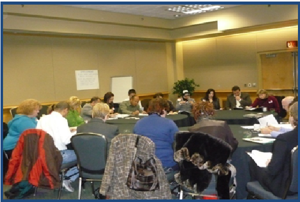
Employment Sub-council Discussion

Nineteen organizations, including Middlesex County, three francophone service agencies, one ethno-cultural association and seven interested citizens from both immigrant and non-immigrant communities participated in the discussions and planning.