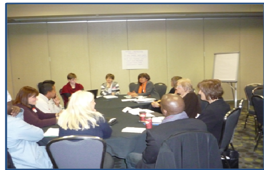
Justice & Protection Services Sub-council Discussion

Immigrants understand the Canadian justice system and have access to information and supports related to preventative services such as, criminal justice, child welfare, and other services.