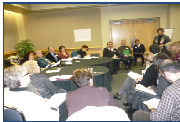
Education Sub-council Discussion

Immigrant learners at all levels (English as a Second Language, Language Instruction for New Canadians, elementary, secondary and post-secondary) have access to timely and appropriate programs and services.