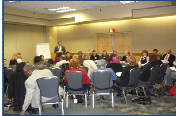
Inclusion & Civic Engagement Sub-council Discussion

Opportunities for participation create a greater sense of belonging to the community. According to Statistics Canada, studies of life satisfaction among the general population show a positive correlation between social ties and well-being.