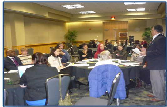
Settlement Sub-council Discussion

Apart from the initial settlement issues of getting the social insurance number (SIN) or the Ontario Health Insurance Plan card (OHIP), immigrants face a variety of logistical challenges. Navigating an unfamiliar city, finding housing, accessing social supports, information on Canadian laws with regard to family, parent-child relationship etc., are some of the challenges that face immigrants as they settle. By enhancing service delivery, through coordinating and partnering with different sectors, settlement will be comprehensive, welcoming and a positive experience for all immigrants.