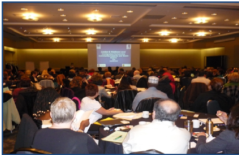
February 2, 2010 Community Action Planning Day

The London and Middlesex Local Immigration Partnership Council was fully established in February 2010.