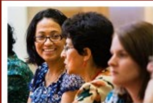
Employment and Immigrant Services Available