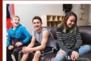
Youth Programs - Explore and Connect at the YMCA