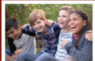
PA Days at Camp Otonabee - Learn More