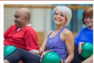
2023 Fall Programs - Register Now!