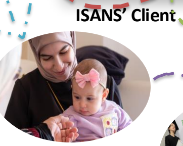
Family Supports & Gender Based Violence Prevention