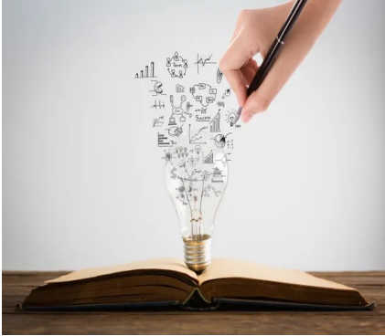
Research & consultations