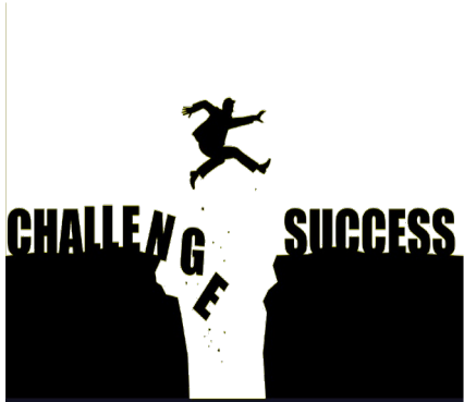
Successes & challenges