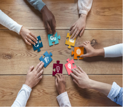
Collaboration & Commitment