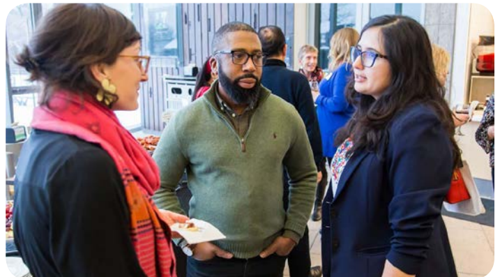
Past and present community partners at the Immigration Partnership's 10+ Anniversary Appreciation Celebration, 2019.