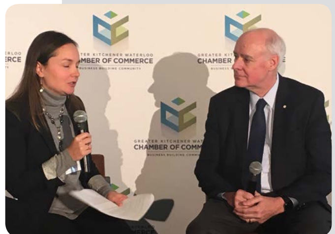
The Hon. Perrin Beatty of the Canadian Chamber of Commerce at the Greater KW Chamber of Commerce/Immigration Partnership "Immigration and the Economy" Forum, 2019.