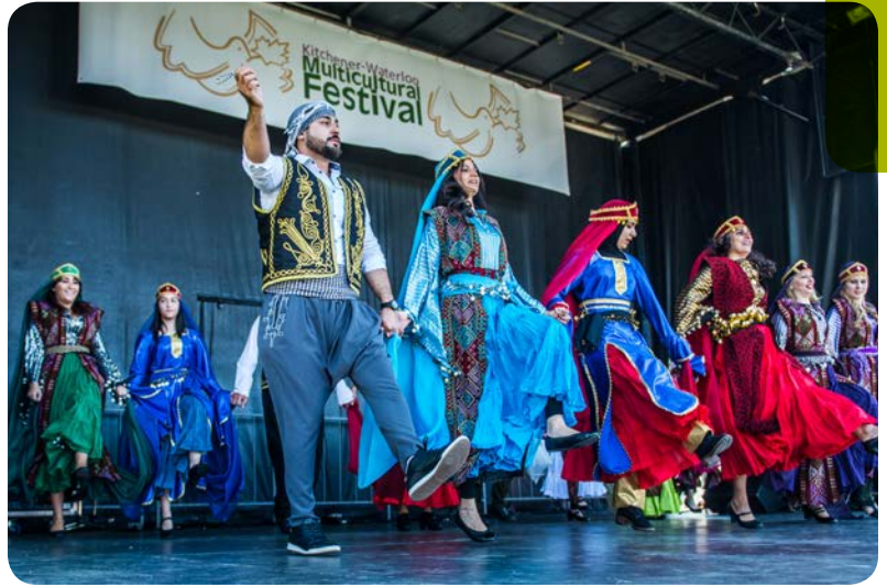
Kitchener-Waterloo Multicultural Festival, 2019.