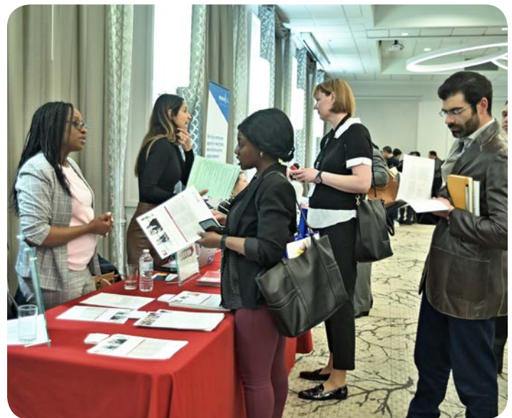
Internationally trained immigrants networking with employers at the 12th Global Skills Conference, March 2020.