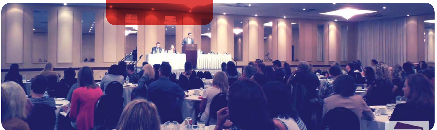
Education event with the Human Resources Professionals Association on hiring immigrants, 2019.

This could target landlords, property managers, private refugee sponsors, doctors, psychologists, tutors and more. It could include collaborating with industry leaders and associations, online affinity groups for learning/information sharing/problem solving/recruitment, awards program for engagement in immigrant success, occasional meet-ups and more.