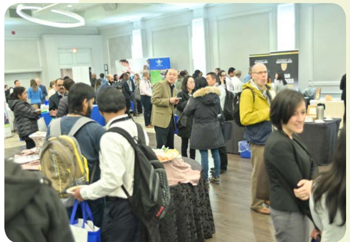
Internationally trained immigrants at the Immigration Partnership's employer networking session at the 12th Global Skills Conference, March 2020.