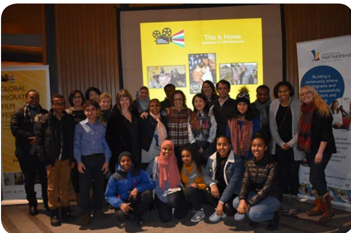
Attendees and organisers of the 2nd Waterloo Region Global Migration Film Festival, Kitchener City Hall, December 2019.