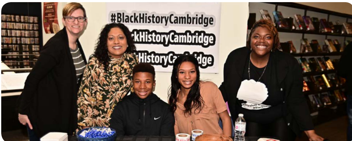
Rhythm & Blues: Celebrating Black History Month at the Idea Exchange in Cambridge.