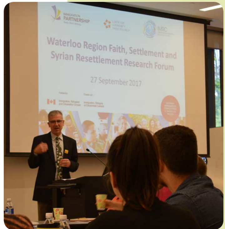
Immigration Partnership's Faith, Settlement and Syrian Resettlement Research Forum, Balsillie School of International Affairs, September 2017.

Some challenges and hurdles are inherent to moving to a new country, and every immigrant journey is unique. Everyone has a role in helping immigrants and the community thrive, and we are committed to helping everyone in Waterloo Region do their part.