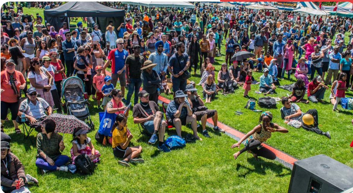
Kitchener-Waterloo Multicultural Festival, 2019.