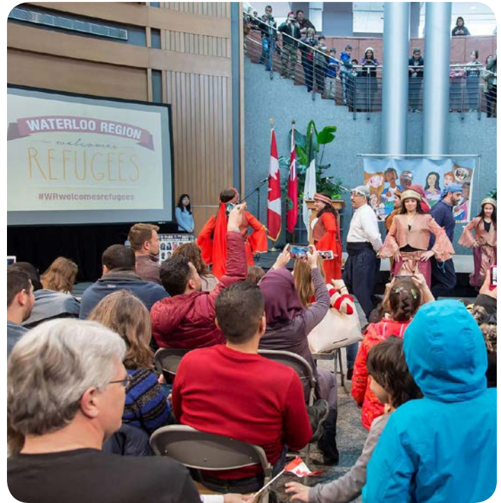
Waterloo Region Welcomes Syrian Refugees community celebration, Kitchener City Hall, March 2017.

There is a pressing economic imperative for immigration. Due to aging populations and low fertility rate, Canada needs new sources of talent to enter the labour force to maintain high living standards. The Conference Board of Canada has reported that between now and 2040, 1.6 million fewer people will become workers than the number of people exiting the labour force. Immigration will account for all of Canada's net labour force growth (projected at 3.7 million workers) and one-third of the economic growth rate. 2