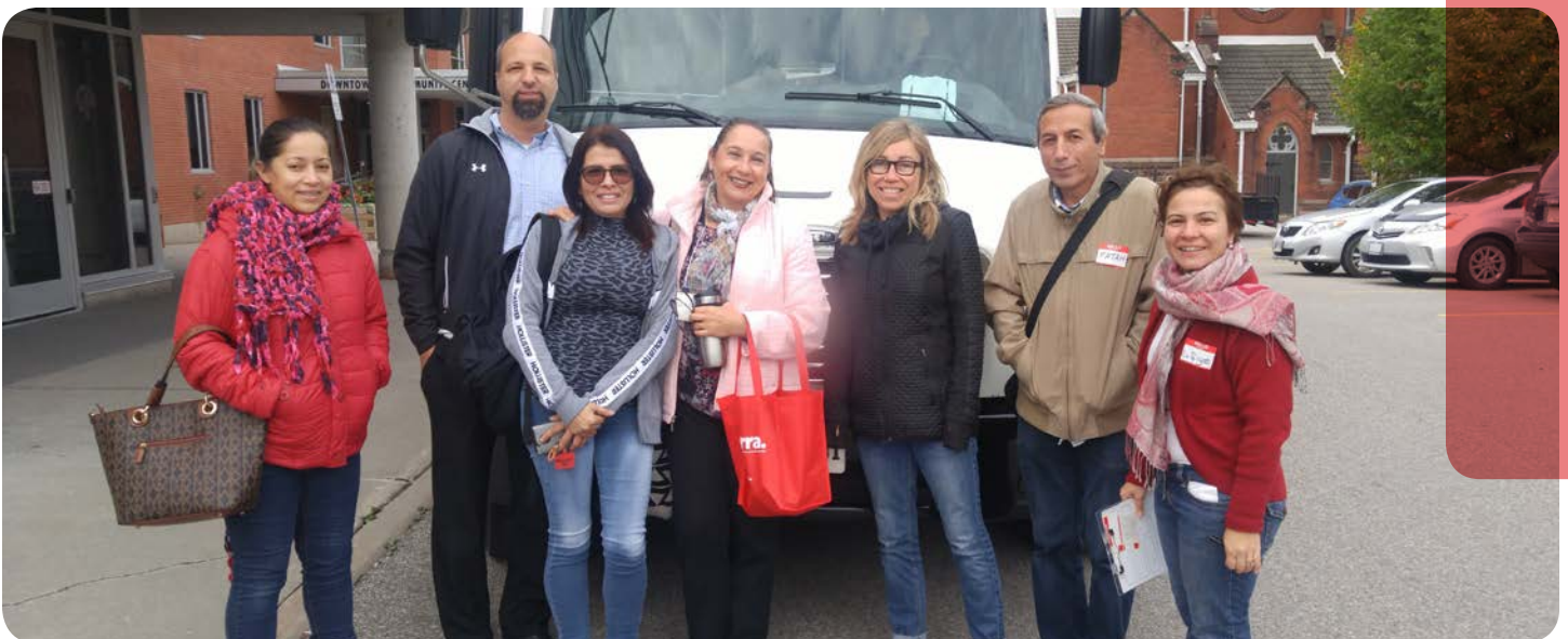
Immigrants meeting potential employers at the Workforce Planning Board/Immigration Partnership Manufacturing Day Bus Tour, 2017.

This could include strategic partnership with industry, economic development, education and skills development associations, tables and forums, partnering to launch an employer-focused immigrant talent hub and other initiatives that make sense, sharing information about immigrants to inform their work, pushing for investments and service changes that work for employers and immigrants, engaging the Immigration Partnership Council in higher level engagement and advocacy and more.