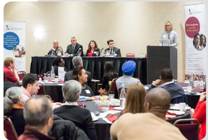
Immigration Partnership's 2018 Community Forum, Kitchener.