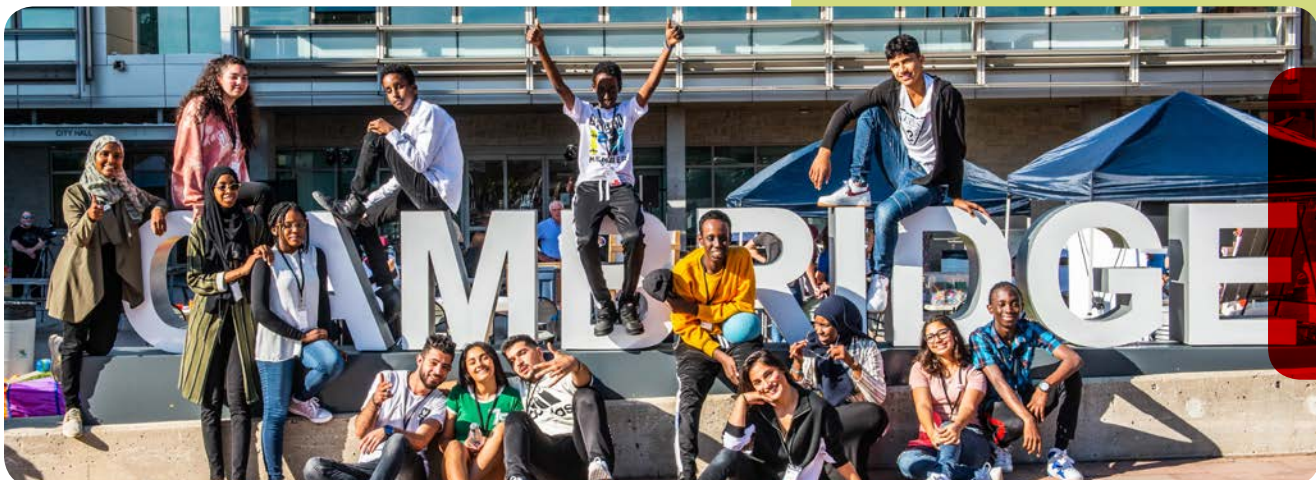
Newcomer Day Cambridge Festival, 2019.

This could focus on municipal, arts, culture, community, faith, service or other tables and forums. It could include partnering on initiatives, informing their work with immigrants, connecting ethno-cultural leaders to their work, pushing for immigrant-friendly investments, supporting development on an Anti-Racism Strategy, engaging the Immigration Partnership Council in higher level engagement and advocacy and more.