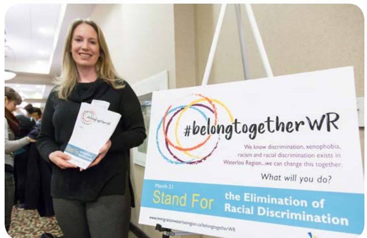
#belongtogetherWR Anti-Discrimination Campaign.