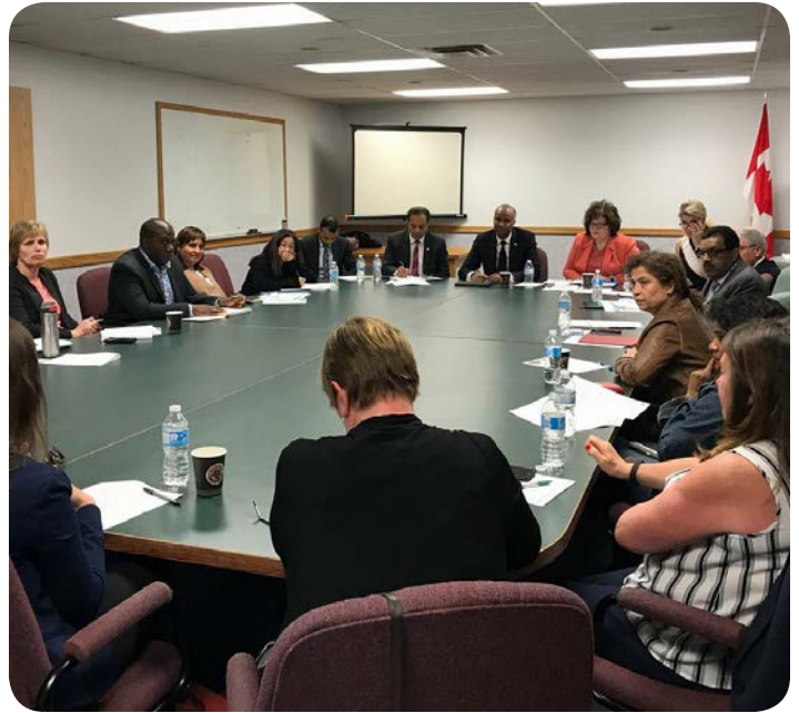
Immigration Partnership staff and partners providing input on immigration priorities to then-Immigration Minister Ahmed Hussen. Kitchener, 2017.