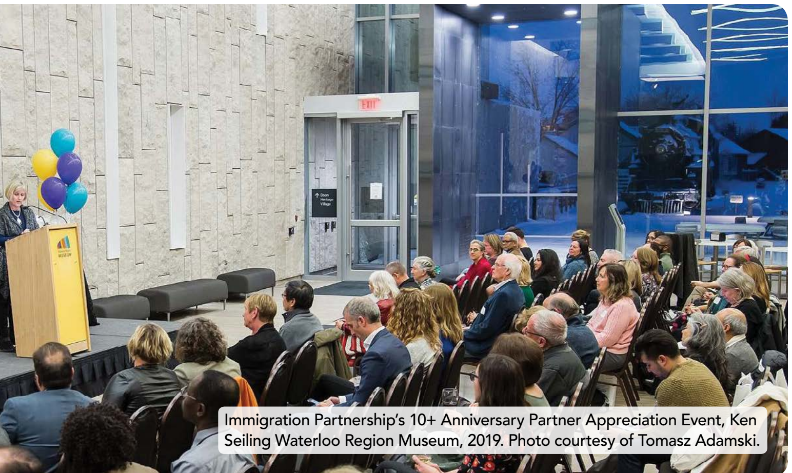
Immigration Partnership's 10+ Anniversary Partner Appreciation Event, Ken Seiling Waterloo Region Museum, 2019.

We achieve this through leadership, collaboration, research, engagement, education and advocacy.