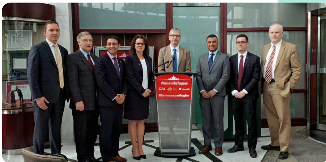
Community Foundations of Canada/Manulife announcement of funding for the Immigration Partnership Council Fund for Syrian Newcomers, Waterloo, 2016.