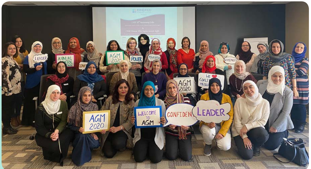
Coalition of Muslim Women of KW Annual General Meeting, 2020.