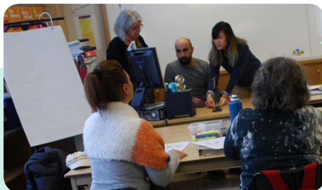
New immigrants learning English.