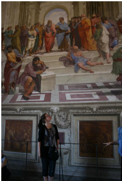
Bocconi University, Rome, Italy