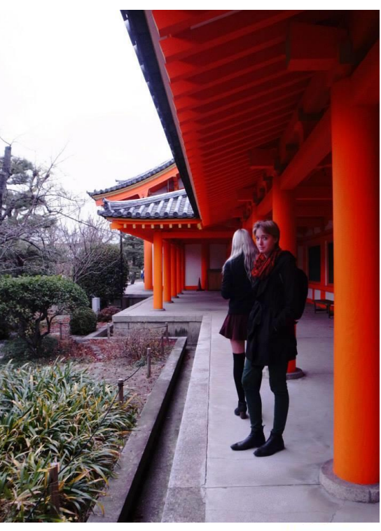
Doshisha Women's College, University Kyoto, Japan of Victoria