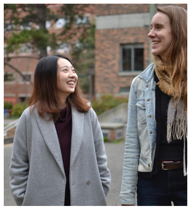
University of Victoria

I love having the chance to share diverse ideas with my conversation students and gain new perspectives.