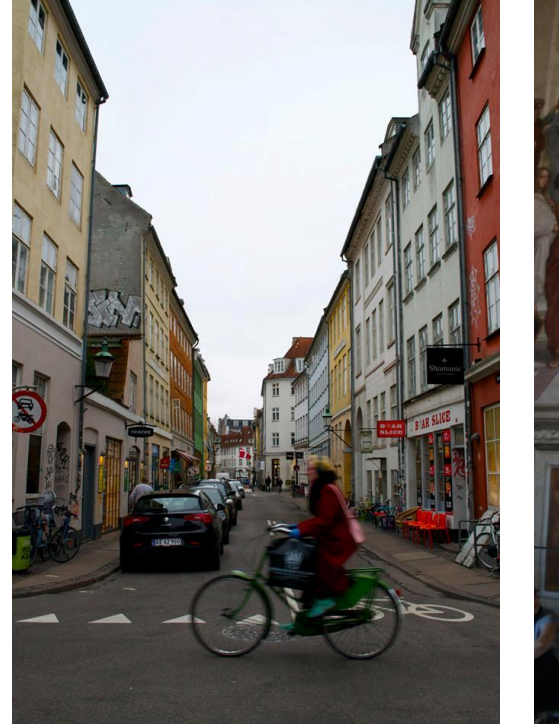
University of Copenhagen, Denmark

The ISS Student Exchange program has partnerships with over 50 universities in 20 countries