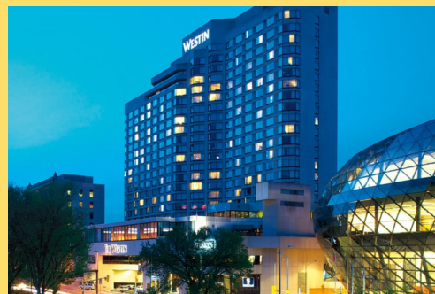
This year's conference will be held at the Westin Hotel in Ottawa

The fourth annual Pathways to Prosperity National Conference will take place in Ottawa on Thursday and Friday, December 1-2, 2016. On Wednesday, November 30, we will also be hosting a full-day workshop for the Local Immigration Partnerships and the Réseaux en immigration francophone. The theme of this year's conference is Shaping Immigration to Canada: Learning from the Past and a Vision for the Future .