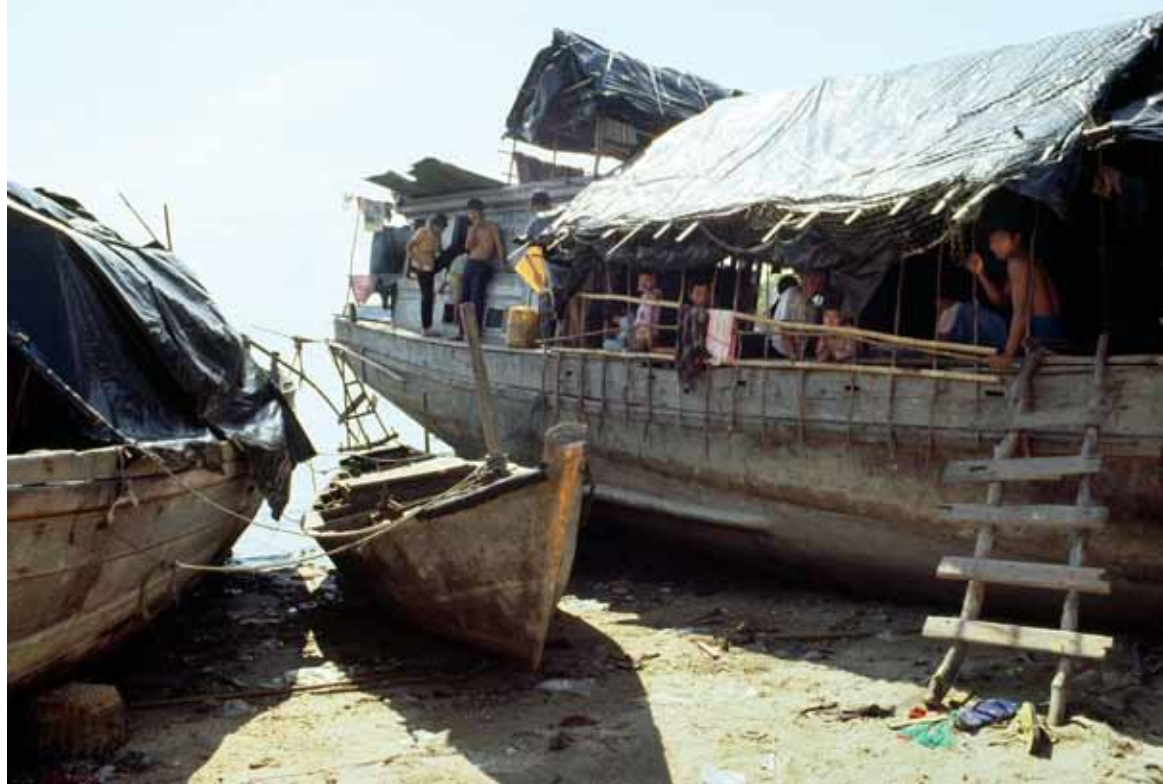
Vietnamese refugees who live in boats anchored at Koh Paed Island in Thailand. 01 January 1978 Photo # 99591

sponsor refugees, and fundraising effort to help settle refugees when they arrive. These networks of collaboration have the potential to significantly increase the voluntary sector's capacity in Ottawa.