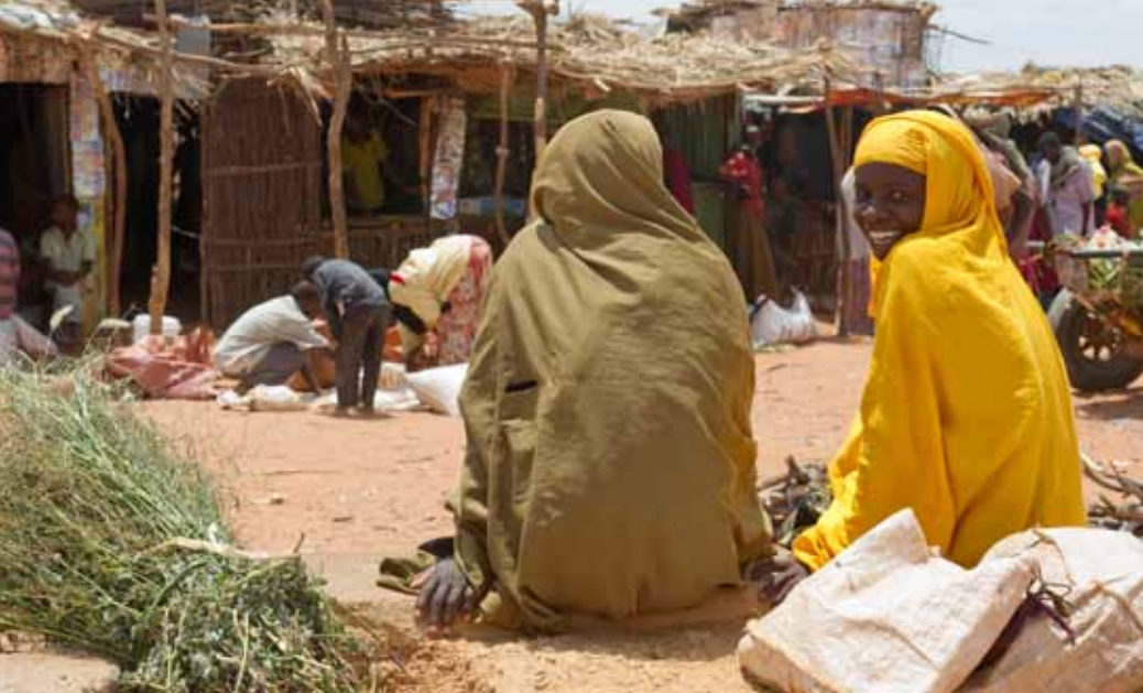
Somali refugees sell goods at their camp in Dollo Ado, Ethiopia. 25 August 2011 Photo # 483001