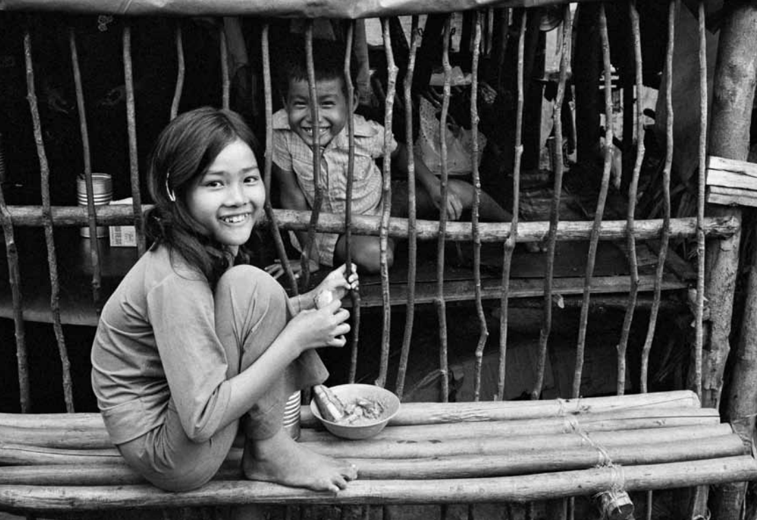
Vietnamese refugees at the Pulau Bidong refugee camp in Malaysia. 01 August 1979. Photo # 100695