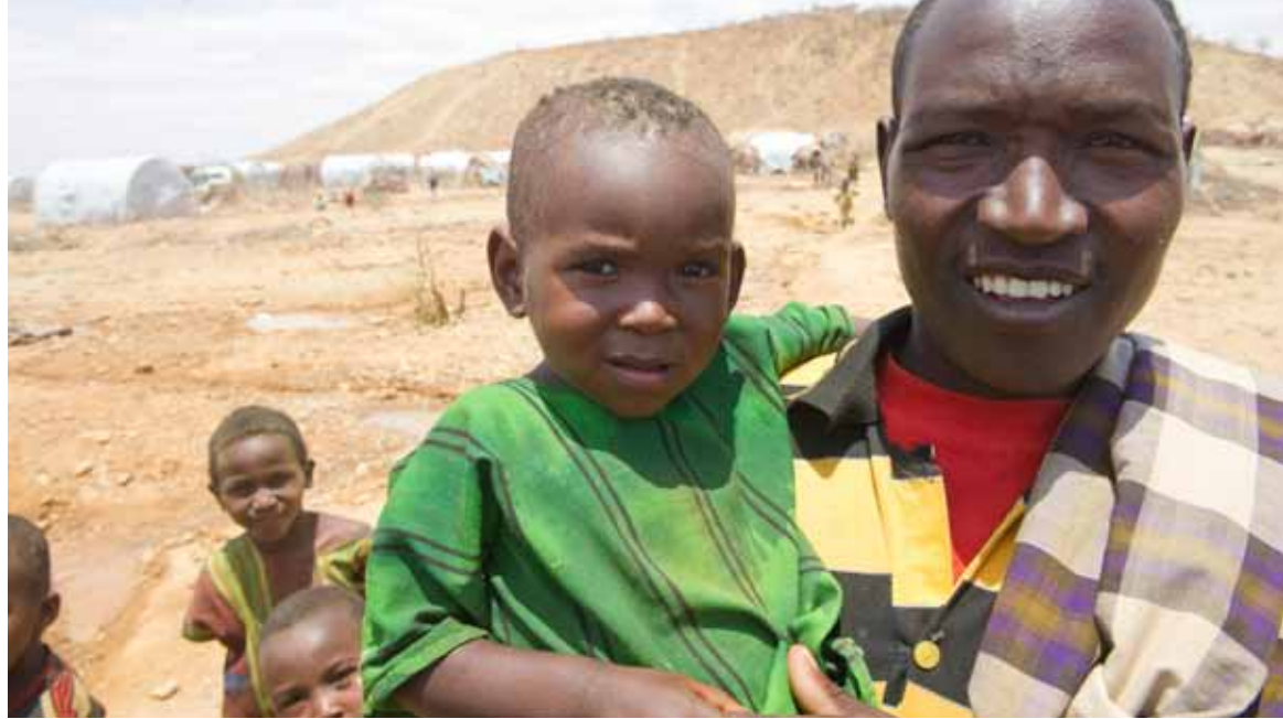
A Somali refugee and his child in Malkadiida, Ethiopia. 25 August 2011 Photo # 483087

* The following is small sample of the origins of the people who have been resettled since the 1990s.