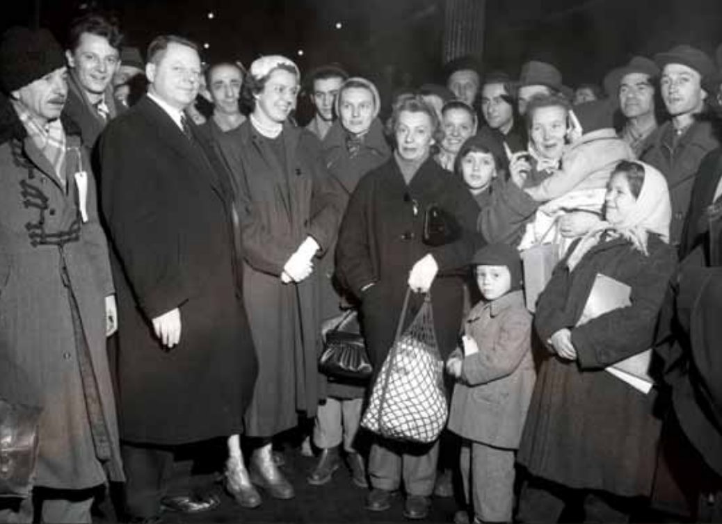
Arrival of Hungarians at Union Station, Ottawa, December 24, 1956.