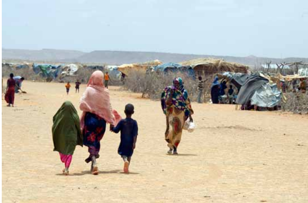
Somali refugees at their camp in Malkadiida, Ethiopia. 25 August 2011 Malkadiida, Ethiopia Photo # 483000