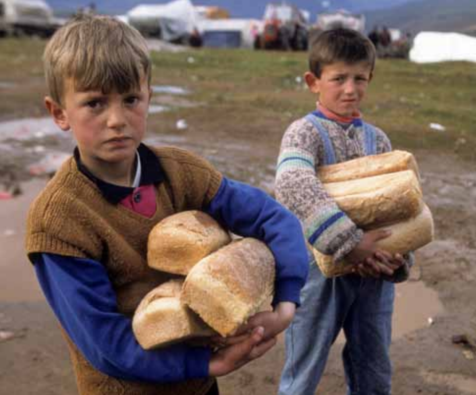
Kosovo Refugees Boys carrying their families' bread rations. 01 April 1999. Photo # 384472