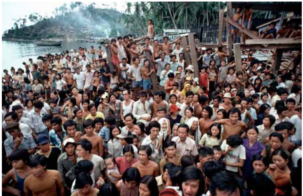
Vietnamese refugees at the Pulau Bidong refugee camp in Malaysia. This camp has about 36,000 Vietnamese refugees. 01 August 1979 Malaysia. Photo # 101363