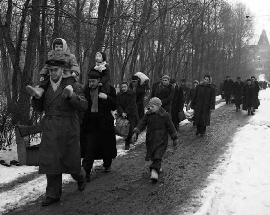
Hungarian Refugees Arrive in Yugoslavia 01 March 1957 Photo # 358004