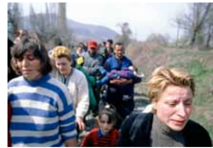
Kosovar refugees fleeing their homeland. 01 March 1999. Blace area, The former Yugoslav Republic of Macedonia Photo # 50810