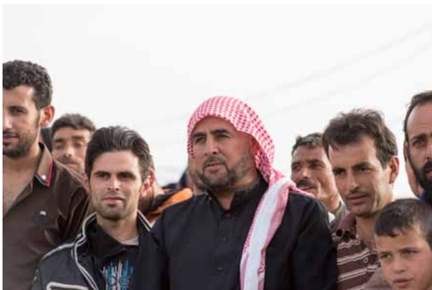
Residents at a Syrian refugee camp in the Beqaa Valley of eastern Lebanon prepare to greet Secretary-General Ban Ki-moon during his visit there today. 25 March 2016 Photo # 668845

(2) A terrorist act has never been committed by a refugee in Canadian history. Despite this fact, Canadians have often viewed refugees with fear and suspicion. Canada has made the mistake of believing entire groups of people guilty by association in the past, for example, when it placed Japanese and German people in internment camps during World War Two. This is a very dark and shameful chapter in Canadian history, and we must be careful not to repeat it.