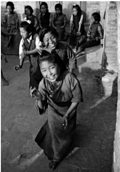
Tibetan girls perform a traditional Tibetan dance in Patan, Nepal. 01 July 1962 Photo # 75204