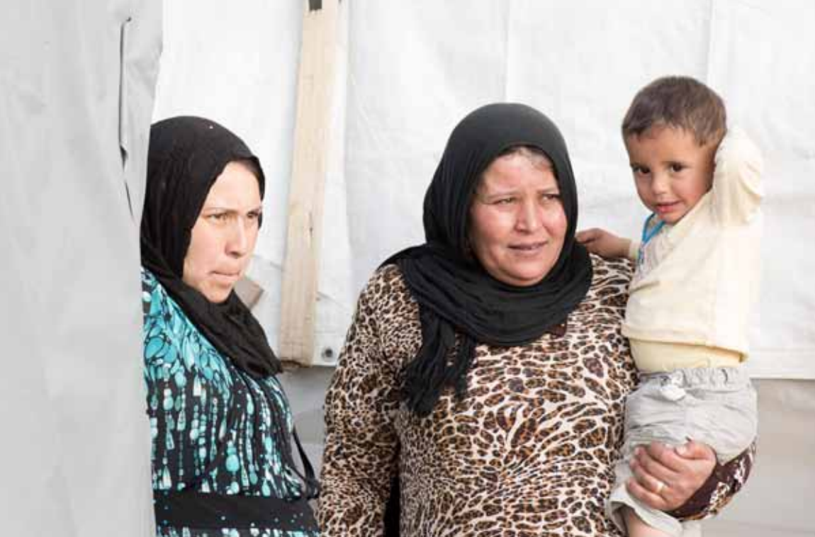
Syrian Refugee Settlement, Beqaa Valley, Lebanon. 25 March 2016. Beqaa Valley, Lebanon Photo # 668850

placed an extreme burden on refugees who came from states where there was no authority to issue or renew passports.