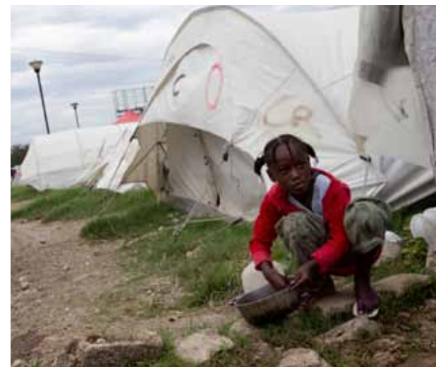
Haiti: Months after the Earthquake A girl washes a cooker outside her tent at the refugee camp of Mais Gate in Port au Prince. 04 November 2010. Port-au-Prince, Haiti

Canada welcomed thousands of Haitian refugees, including many orphaned children, after the devastating 2010 earthquake in Haiti.