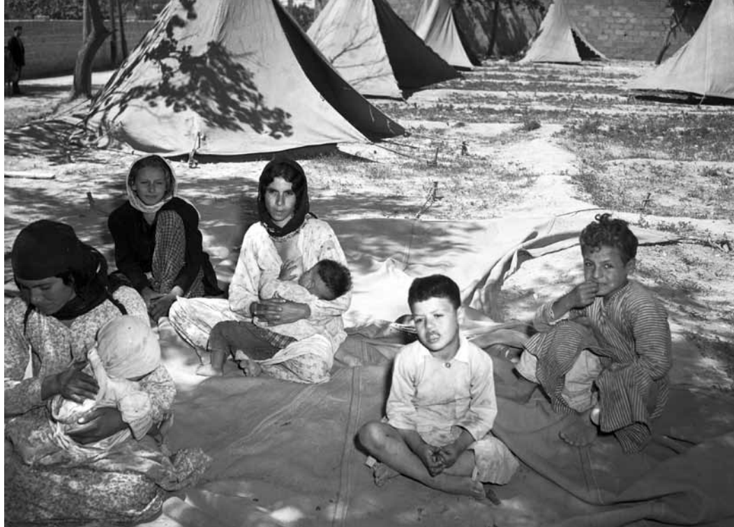
Palestinian Refugees in Refugee Camps Children at the Damascus Reception Centre. [1948?] 01 January 1948. Damascus, Syria. Photo # 328299