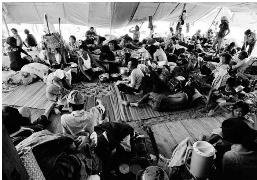
Vietnamese refugees living at the Songkhla refugee camp in Thailand. 01 July 1979 Thailand. Photo # 100465